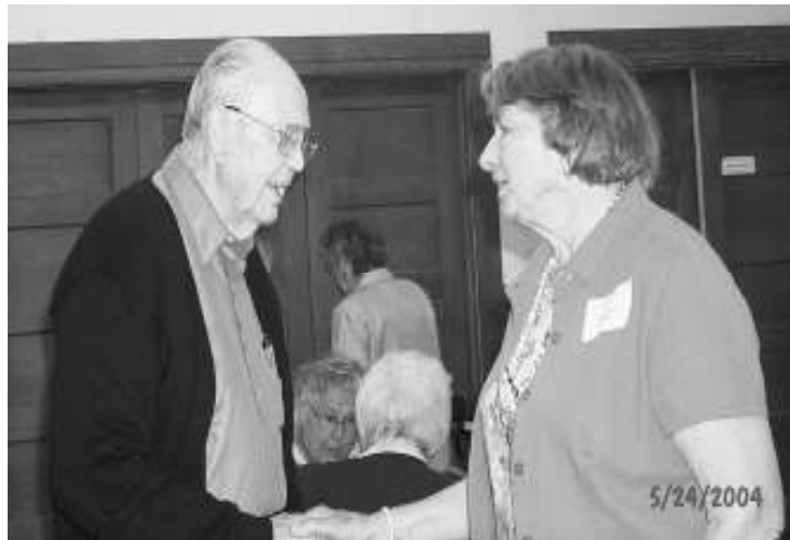
This Point.....in time