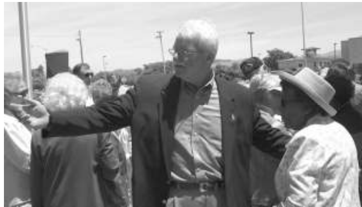
Congressman George Miller at the Ribbon Cutting Ceremony