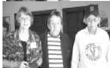
This Point.....in time