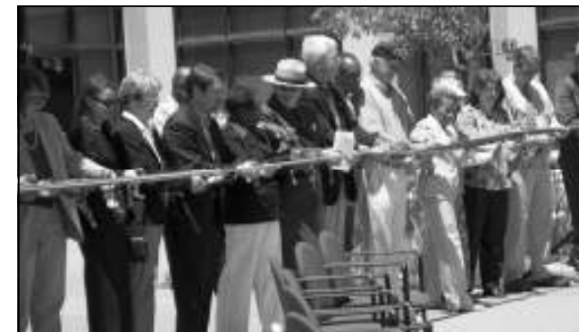
Cutting the ribbon

You don't have to write an article (even though that would be nice), just notes about your experiences and remembrances of our home front war effort. With our new National Park coming along these questions will become more and more compelling. If I can get information from enough of you maybe I could save it up for an issue with that as a theme.