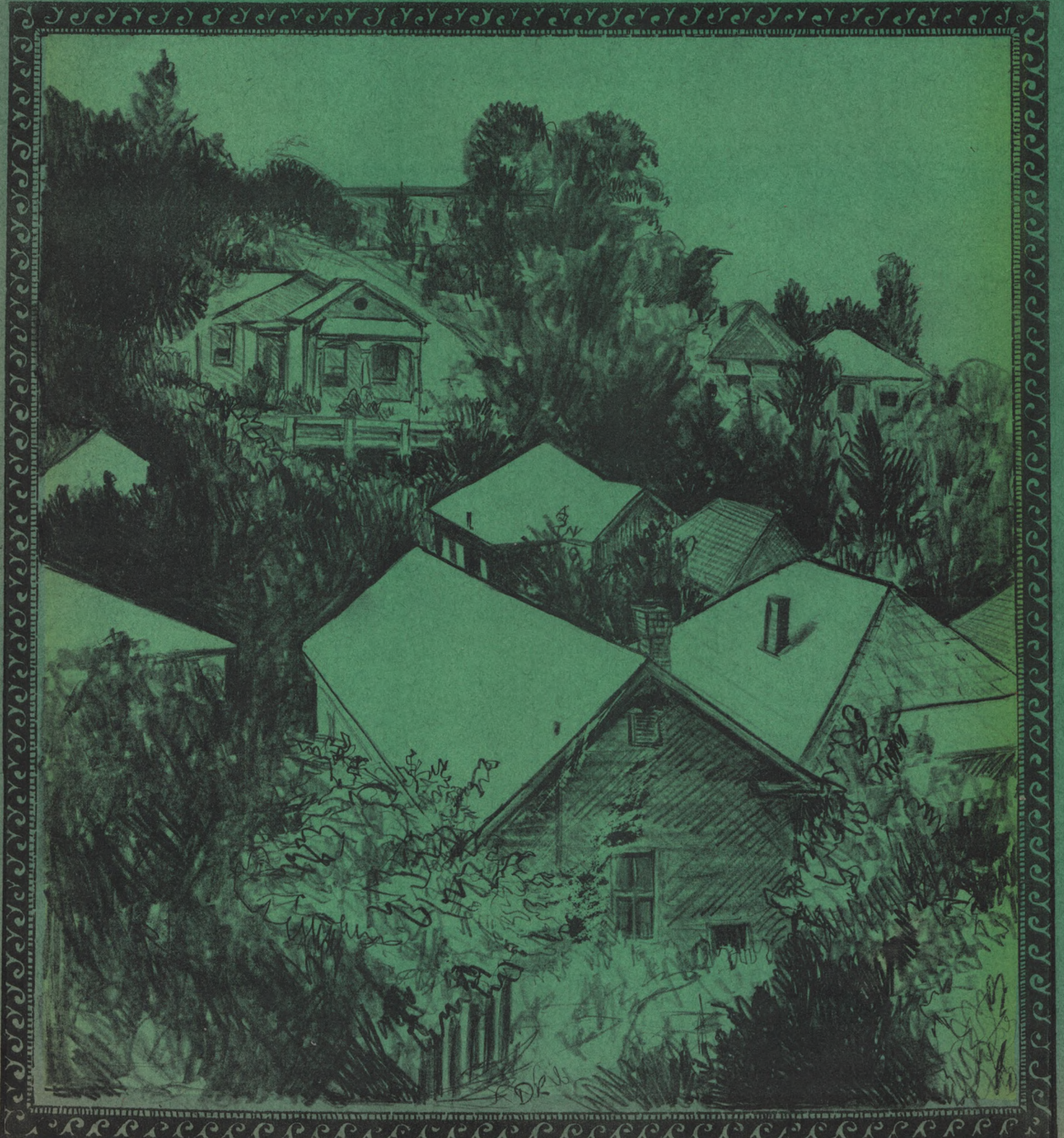
• From Crest Ave. Looking North •