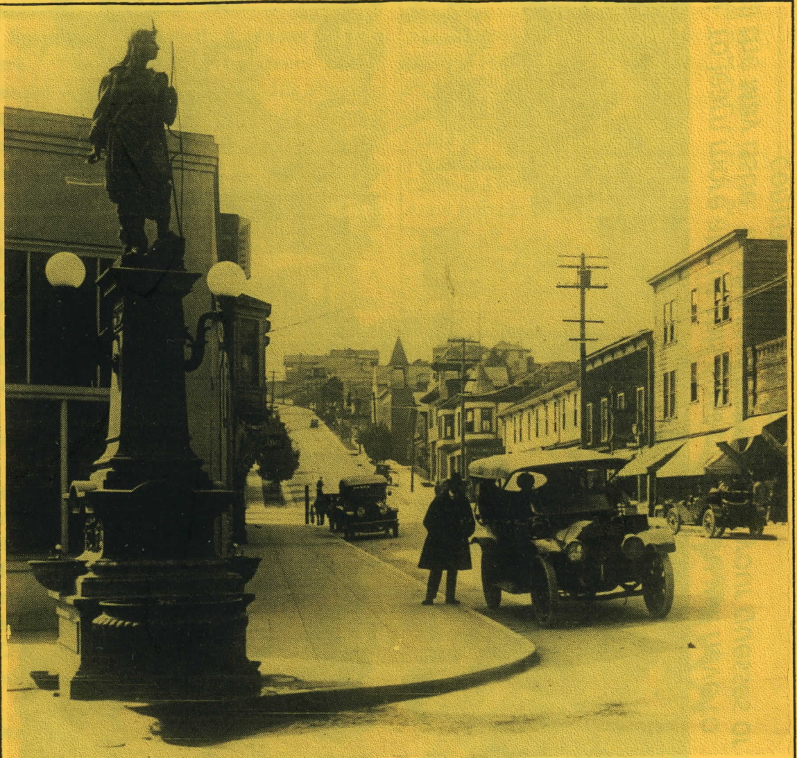
Washington Avenue, 1915